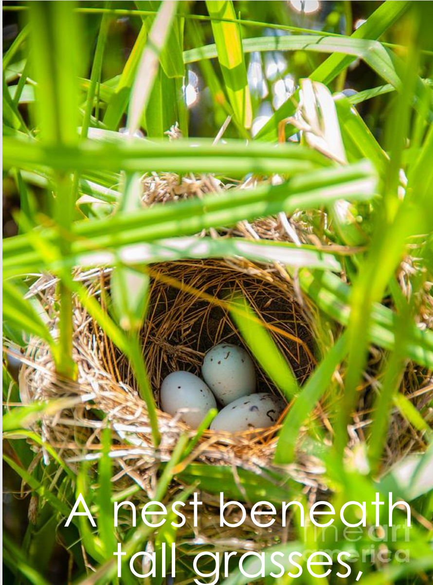
A nest beneath tall grasses,