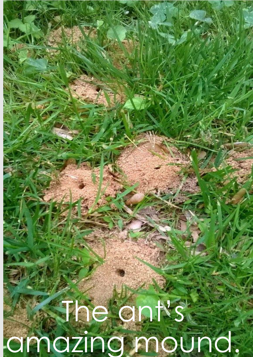
The ant's amazing mound.