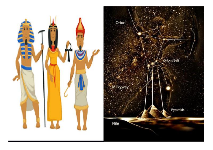
Pharaohs and Osiris Constellation

The Pharaohs were considered Gods incarnate and immortal. They lived a powerful life and wielded their influence over the land endlessly. Death was only an intermittent phase between life and eternity. They were believed to be entitled for a brilliant after life, the Egyptians followed elaborate funerary practices. Their bodies were preserved for eternity. The God of underworld and afterlife was Osiris. He was a generous judge of the pharaoh's deeds and granted him an eternal life after a rigorous process of hearing and pleading of the dead soul. Egyptians believed that Orion constellation, symbolic of Osiris himself, is said to be guarding the pharaohs' tombs.